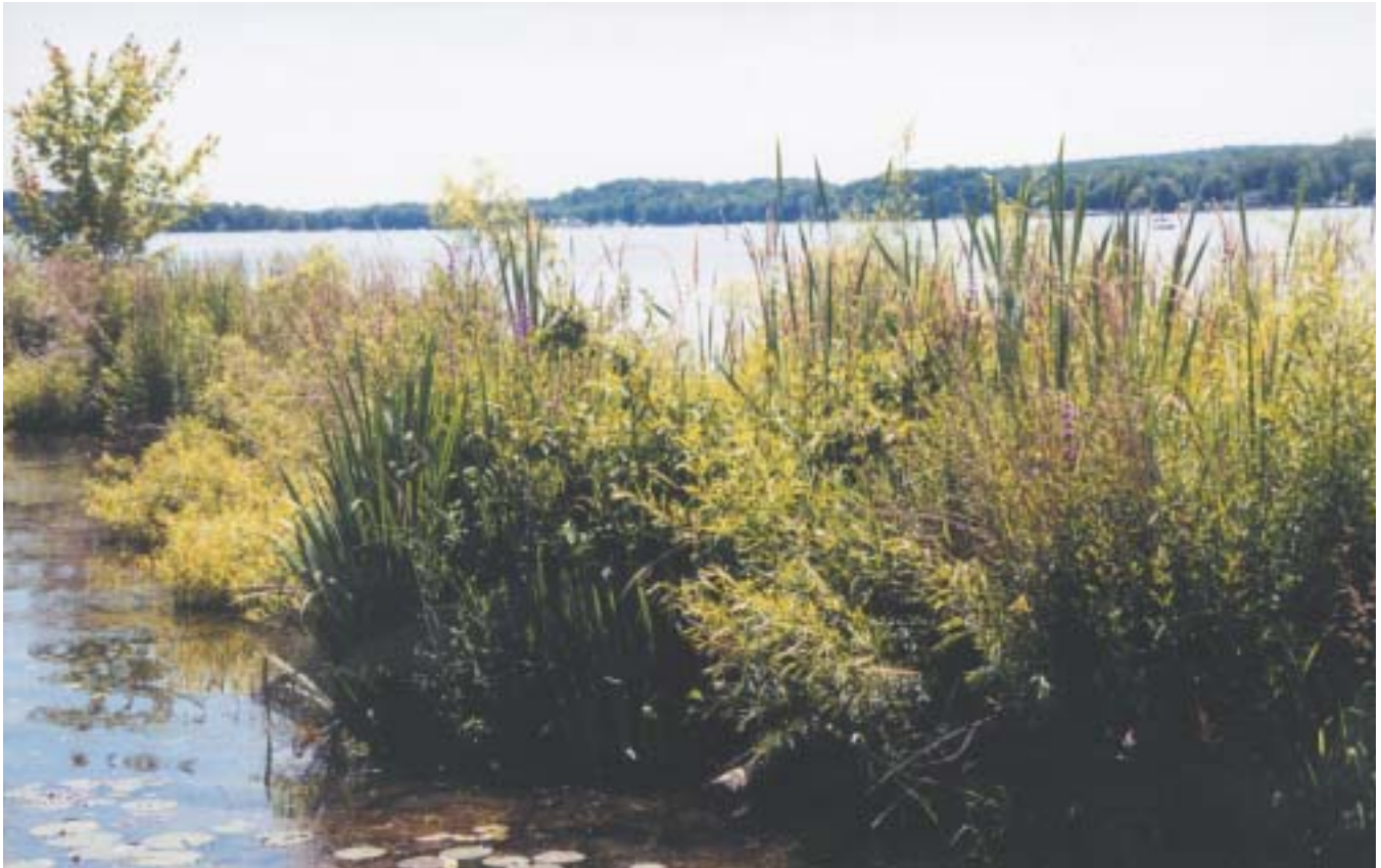
Shoreline buffer zones like this provide crucial habitat for waterfowl and fish.